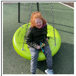
Here comes the Sun! Fake Spring Fun!

Cold weather does not stop the good times!